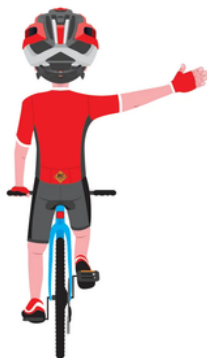
Turning Right →

Hold your left arm out and bend your elbow like an upside down “L”. This lets others know you’re STOPPING .