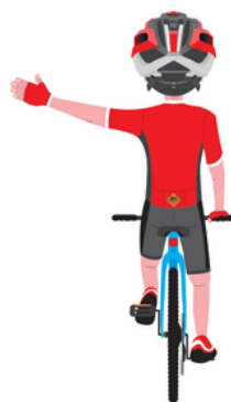
← Turning Left

Hand signals are like using turn signals in a car - it shows others what you are about to do! Here are 3 hand signals everyone should know: